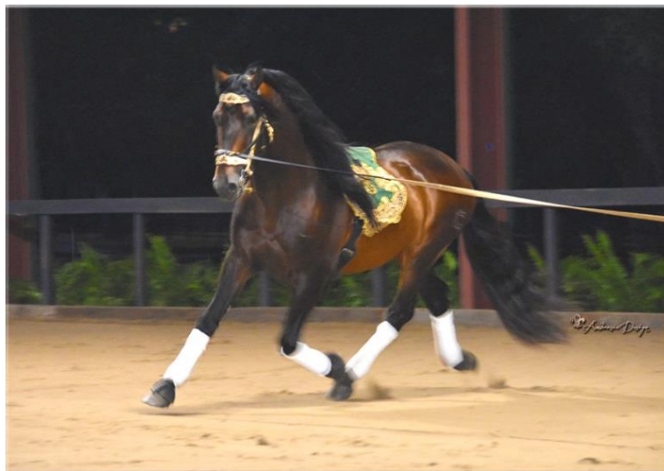
GOMERO III – Imported PRE Stallion